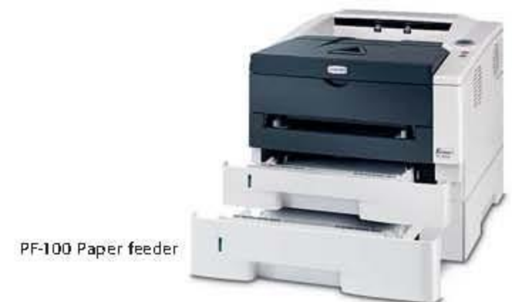
PF-100 Paper feeder